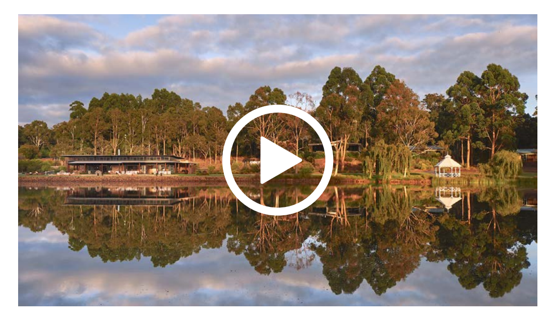
WATCH: DESTINATION WA - EIGHT WILLOWS RETREAT